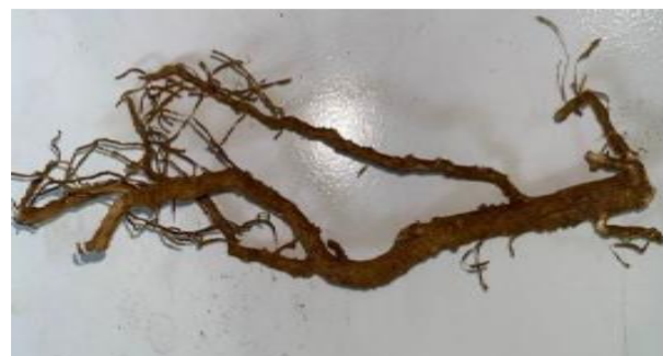
Figure 1: Saluang belum ( Luvunga sarmentosa )

Luvunga sarmentosa root (4 kg) was obtained from Desa Buhut, Muara Teweh, Central Borneo. The root was washed and cut into 1 cm pieces before drying for 14 days. The dried root was then ground into a 2 kg net-weight powder. Saluang belum root infusion was made in an infusion pan heated to 90°C and kept warm for 15 minutes. Figure 1 shows the root of Luvunga sarmentosa .