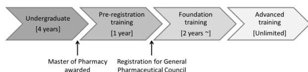
Figure 2: General structure of pharmacy education in England

complexity of scenarios is gradually increased towards the final year of the course as students deepen the understanding of the subjects as well as gain the transferability of skills to apply knowledge to practice.